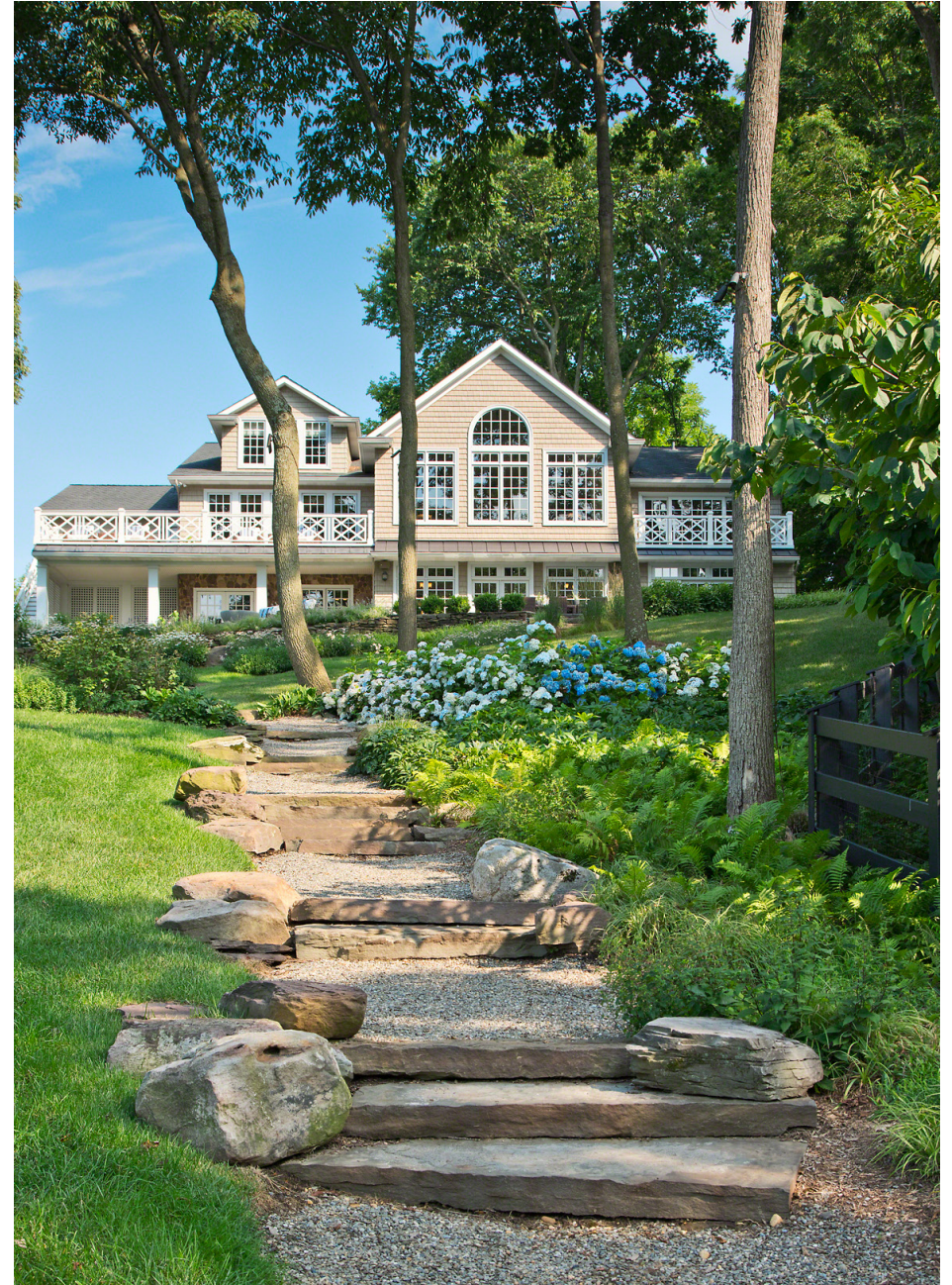
PIPER-TUTTLE RESIDENCE Maryland Chapter ASLA Award 2018