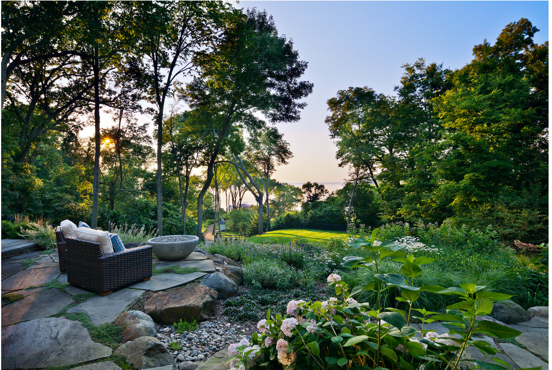
PIPER-TUTTLE RESIDENCE Maryland Chapter ASLA Award 2018

A fire bowl serves as footrest by day and focal feature at night while garden visitors enjoy a northwest view over the upper Chesapeake Bay