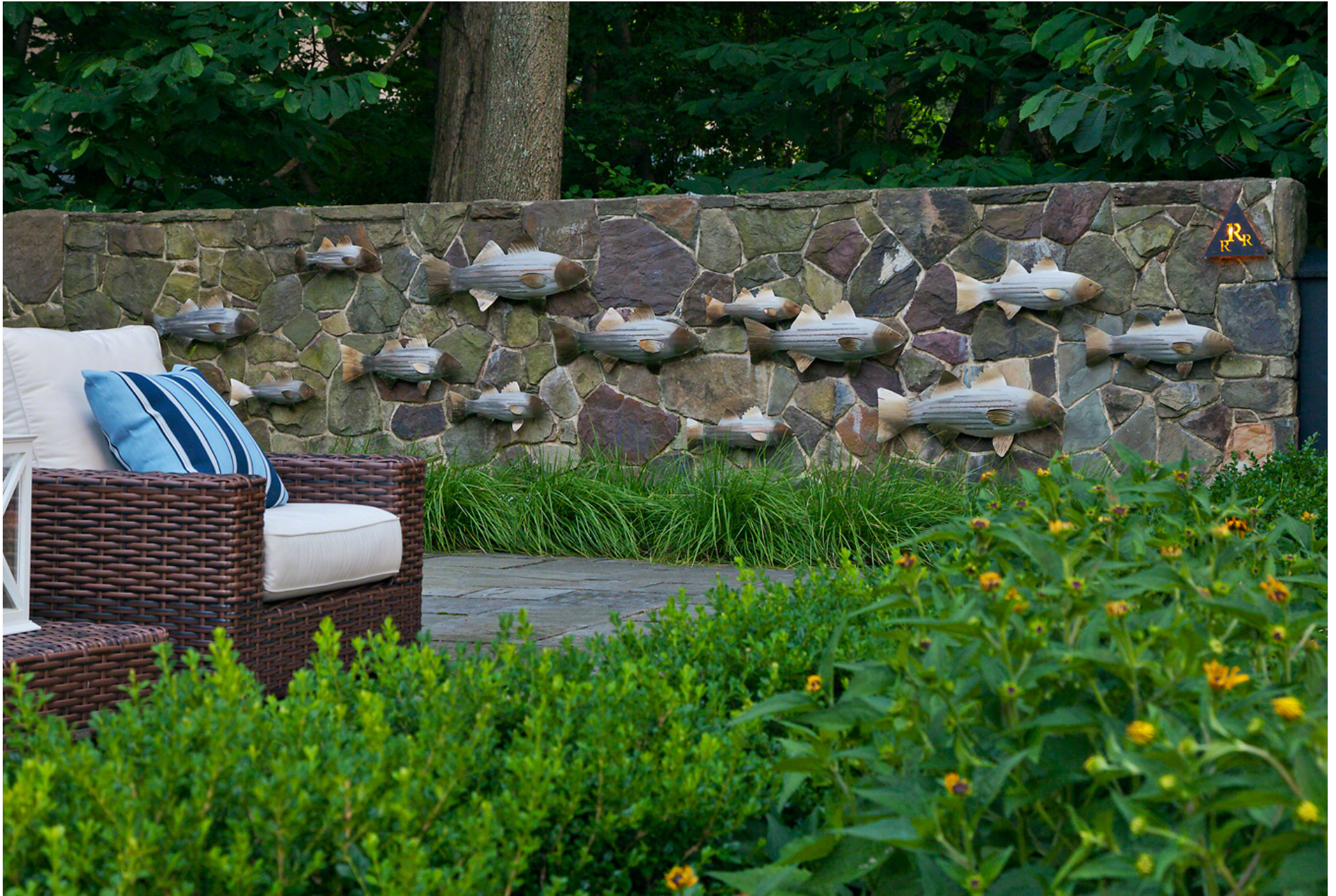
PIPER-TUTTLE RESIDENCE Maryland Chapter ASLA Award 2018

This fieldstone wall comes alive with stainless steel fish sculptures designed by the LA and crafted by a local artist. The fish echo the owners love of, and respect for, the life in and around the Chesapeake Bay. A custom copper light in the upper right-hand corner of the wall was designed by the LA and refers to the property name, Red Right Returning.