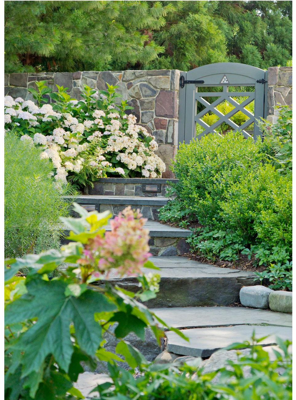
PIPER-TUTTLE RESIDENCE Maryland Chapter ASLA Award 2018

a. Traversing the steep grade from driveway down into the garden is an experience in texture and color. Stone walls and paving are softened by Hydrangea, Threadleaf Amsonia, and Ferns b. The LA designed and locally crafted wooden garden gate provides an elegant transition between front and back gardens while also serving the practical purpose of securing the garden