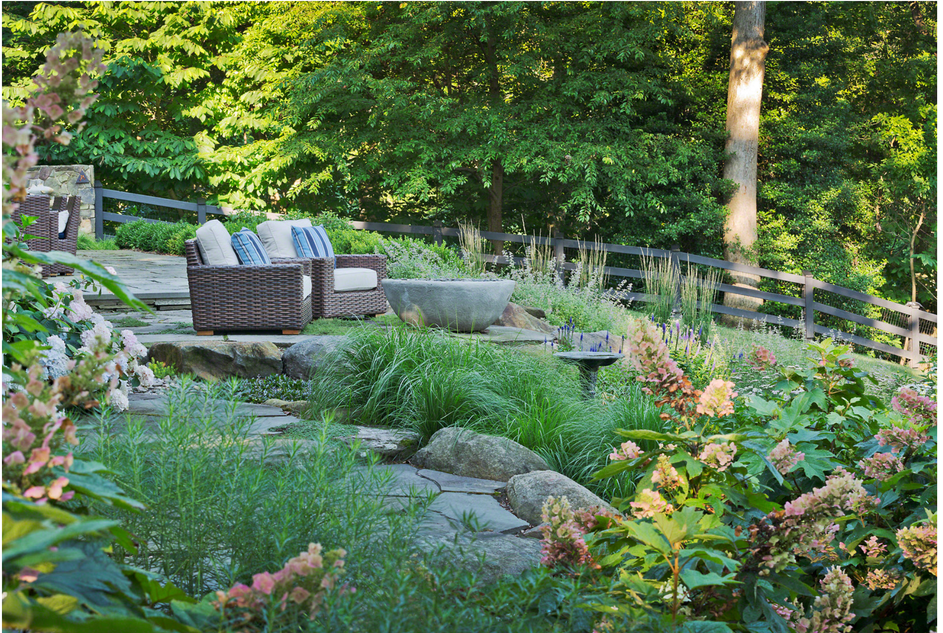
PIPER-TUTTLE RESIDENCE Maryland Chapter ASLA Award 2018

A board fence painted black defines the edge between wild woodland and managed garden while also securing the rear garden for pets. Irregular flagstone, thermaled bluestone, fieldstone, and boulders form both organic and formal spaces within the same area