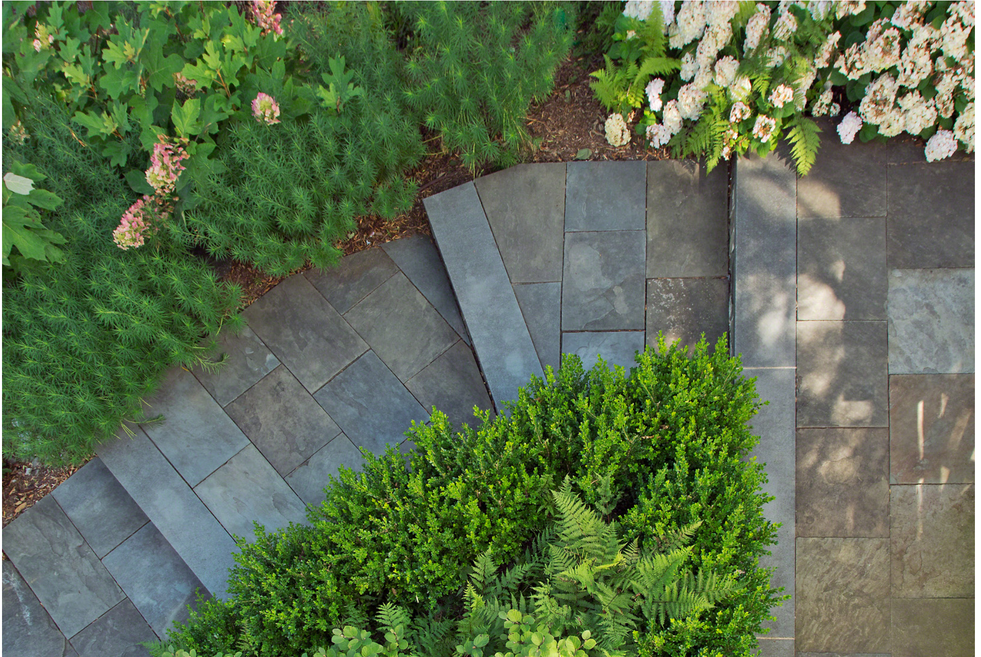
PIPER-TUTTLE RESIDENCE Maryland Chapter ASLA Award 2018

Simple design, local materials, and native plants combine to create a composition of complex colors and textures