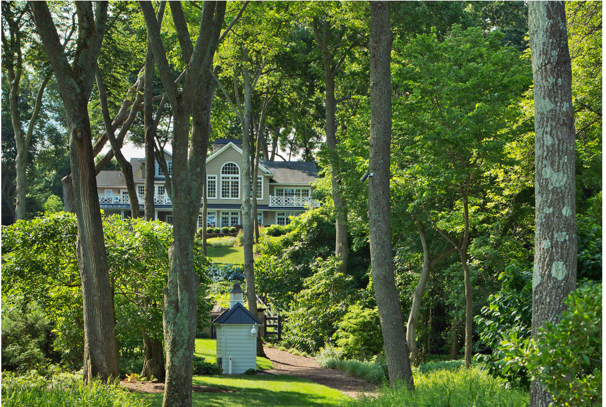
PIPER-TUTTLE RESIDENCE Maryland Chapter ASLA Award 2018

View from the beach back toward the house through groves of mature trees that were preserved by the LA. Shed, Mulch path, and Beach Gate can be seen below the house