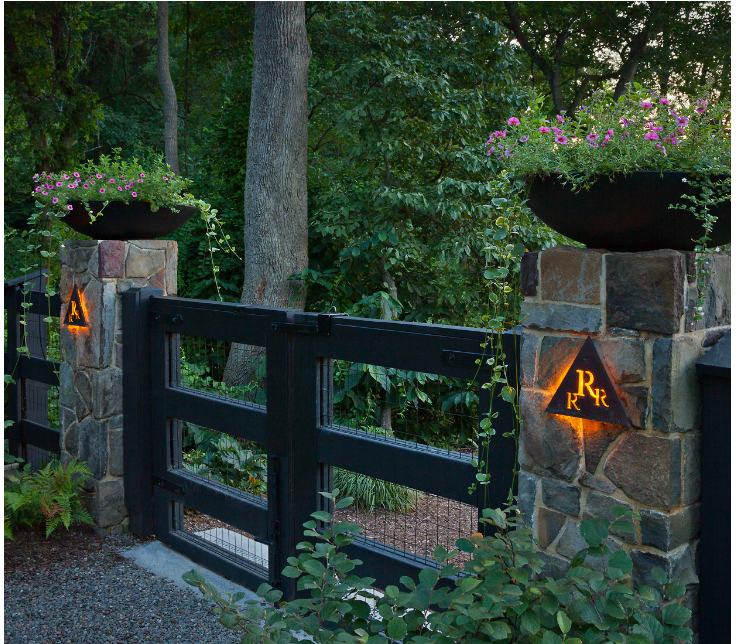
PIPER-TUTTLE RESIDENCE Maryland Chapter ASLA Award 2018

For ships returning home, the phrase "Red, Right, Returning" is a reminder that the red bouy should be kept to starboard. With that in mind, plus the presence of a red bouy off the dock, 'RRR' has become the name and logo for this property. The Beach Gate delineates the transition from gravel to mulch path, and serves as gateway with custom copper lights designed by the LA.