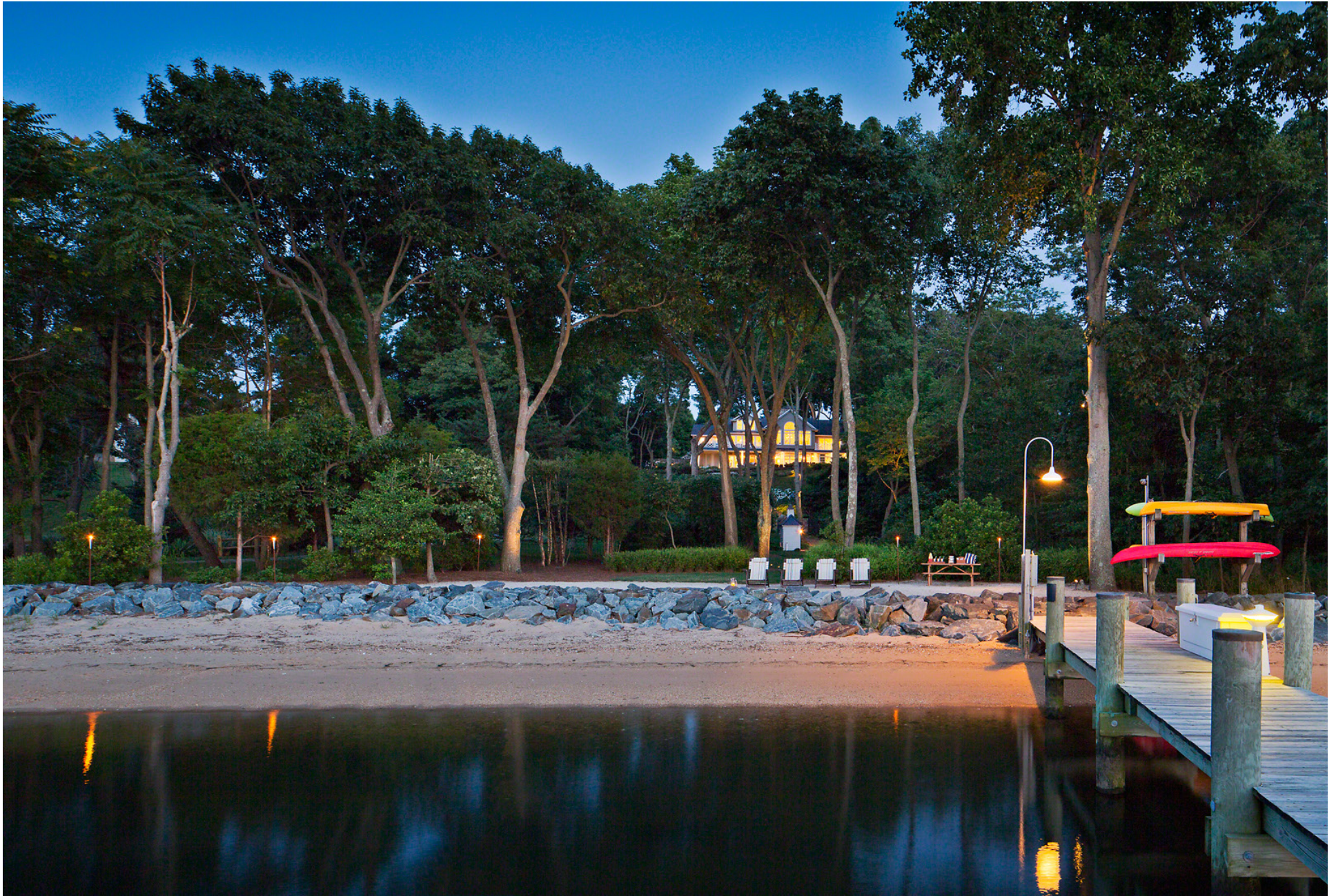
PIPER-TUTTLE RESIDENCE Maryland Chapter ASLA Award 2018

Coming back after a long day on the water, the warmth and comfort of a subtly lit and lushly planted path leads back home