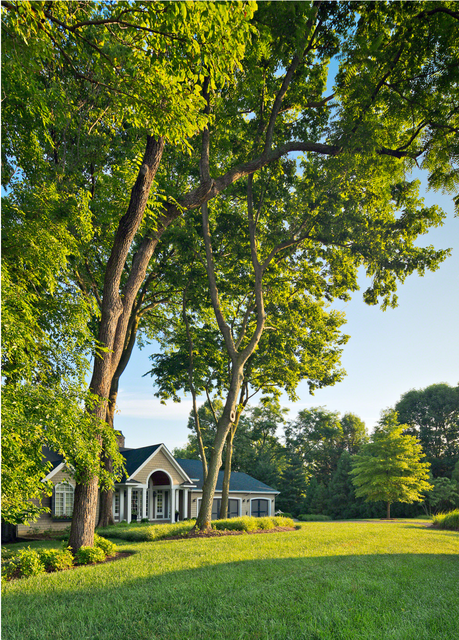
PIPER-TUTTLE RESIDENCE Maryland Chapter ASLA Award 2018